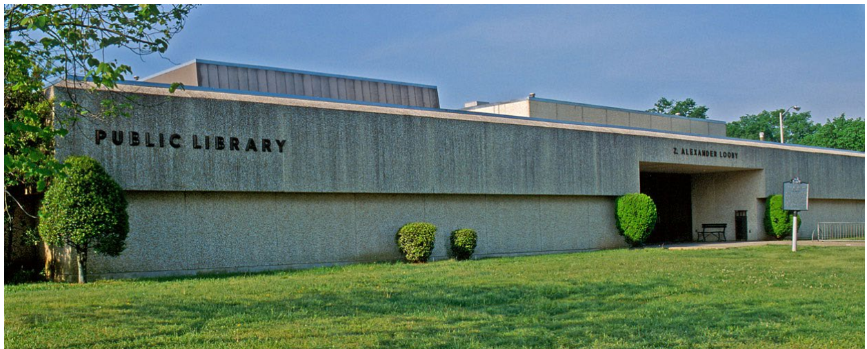
Front façade of the Looby Recreation Center, Theater and Library