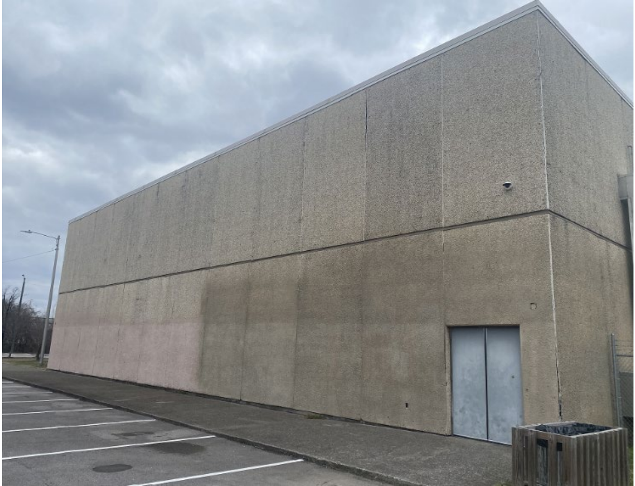
Mural Site: Western façade of the Looby Recreation Center, Theater and Library